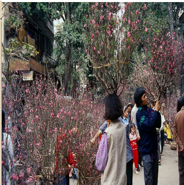
Peach trees at Tet flower market in Hang Luoc Street, Hanoi, 1994; Photo: Nguyen Kim Long.