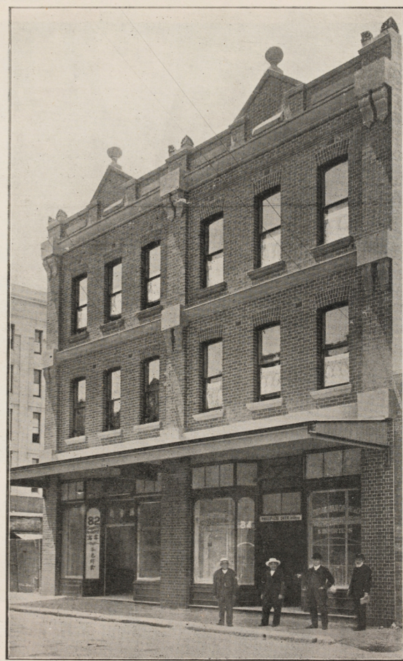
The original Edwardian shop fronts at 82-84 Dixon Street.

above them. Here is an opportunity to retain a little of Dixon Street's history and I sincerely hope that the listing will be approved.